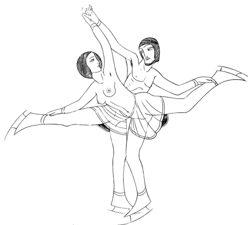
Image: Eric Gill, Skaters , copper engraving.

Eric Gill excelled in many art forms—sculpting, typography, and draughtsmanship, among others—but his wood and copper engravings are often his most graphically compelling works.